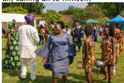
The International Day at Harlow Museum

By God's grace, and only by his grace and in his strength, our prayer is that God's church in and around Harlow continues to shine as a light in deed and word. In this way Christ is made known and in this way God calls out to all, calling all to himself.